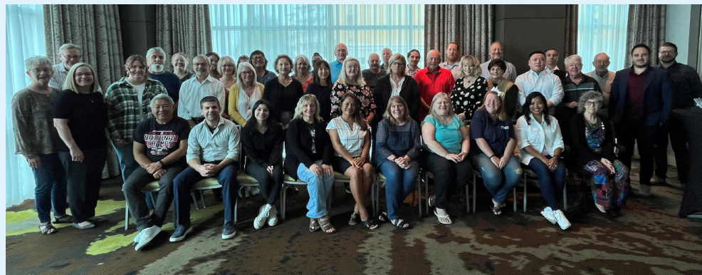
BTMed at its team meeting, November 2024.

As BTMed embarks on its 28 th year, we know that our program's mission wouldn't be possible without you—our medical providers. Your hard work has improved—and even saved —the lives of the Department of Energy's former construction workers, a population whose work puts them at risk for occupational illnesses. It's because of you that they not only get screened, but also return for their re-screening exams every three years.